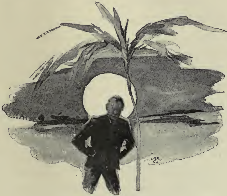
MY NEPHEW STRODE BACK.

Good-night! If you want to be reassured, think of Parker's gun. He's no end of a shikari!' and my nephew strode back to his tent in the moonlight, leaving me holding open the flap of mine, of two minds whether to go after him or not.